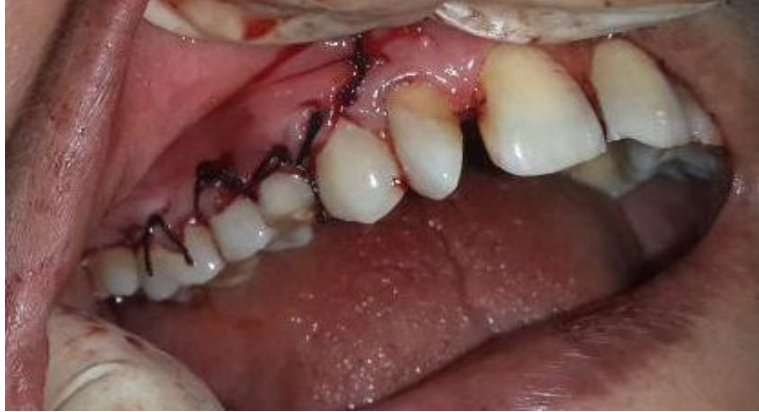
Fig6: IOPAR at 6 months showing bone fill in the defect