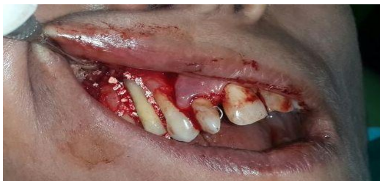
Fig.5: Flap was sutured with 3-0 silk suture.