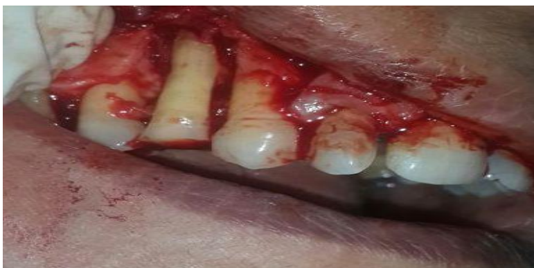
Fig 4: Hydroxyapatite crystals were placed in the bone defect.